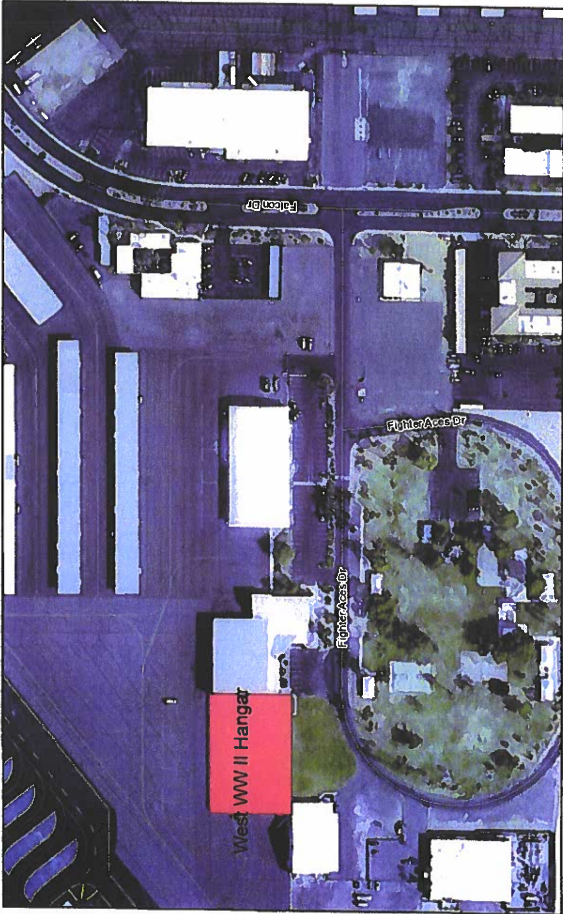
Exhibit "B" Depiction of Premises